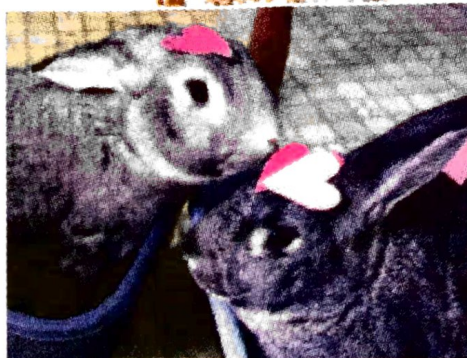
Ma and Pa Kettle, adopted in 2008

Another little-known fact about shelter adoption is the wide variety of pets we have available—not just dogs and cats, but rabbits, ferrets, hamsters, horses, birds, goats, geese, and more. If your heart is set on a purebred pet, please don't skip a trip to our shelter. We almost always have purebreds, big and small, available for adoption—and of course, wonderful mixed-breeds, too.